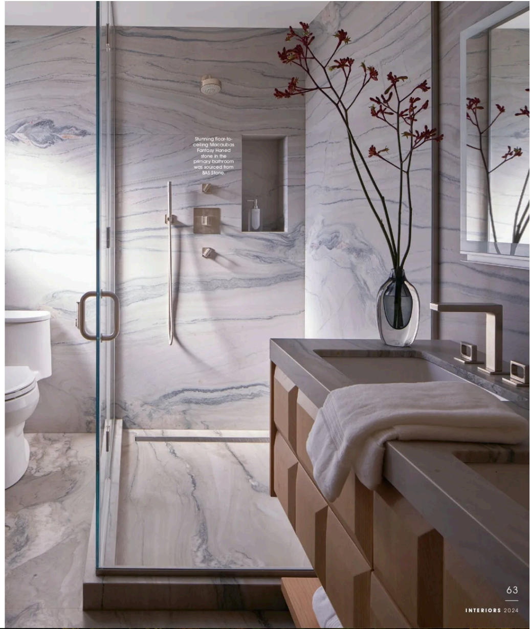
Stunning floor-to-ceiling Macauba Fantasy Henge stone in the primary bathroom was sourced from BAS Stone.