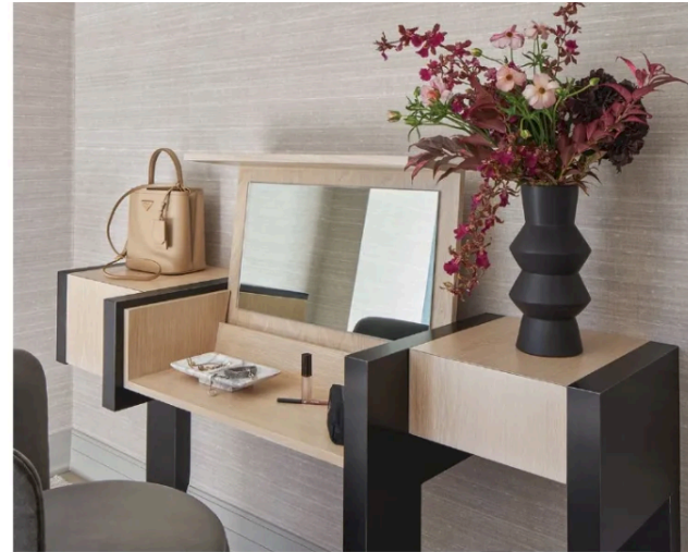
Clockwise from top: The custom vanity in the primary bedroom is a replica of the Avenue Road Kitale table; SuiteNY's Stay lounge chair is finished in chic Gubi velvet; BAS Stone's Carchio Copacabana Polished stone slabs in the powder room; Opposite page: Custom stacked nightstands and Roll & Hill's Fiddlehead pendants add an artful edge to the primary bedroom.