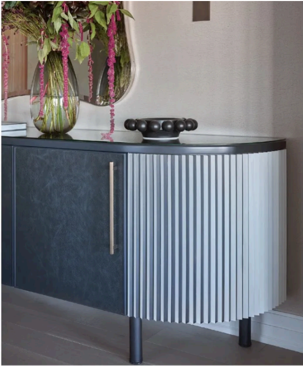
From top: The entry features a custom copy of a ddc console with Pollock's Saddle leather on the doors, counter stools from Artistic Frame.